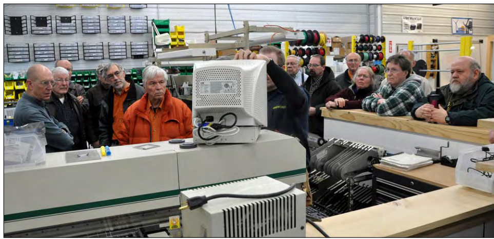
Club members watch a demonstration of APRS World's manufacturing process.