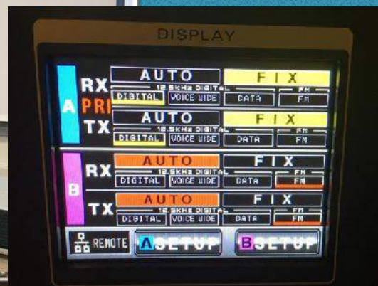
Clare Jarvis, KØNY, shows off the club's newest Yaesu Fusion repeater during the club's Dec. 20 meeting. The unit may be set-up via a touch screen (inset).