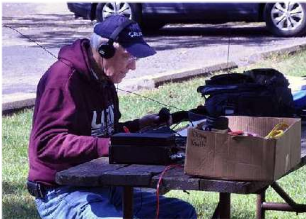
W9LSE WORKING THE WIPOTA EVENT.