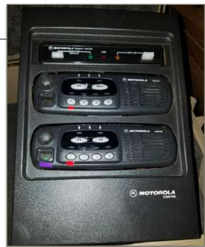
WARC'S PORTABLE MOTOROLA REPEATER.

The Value of ARRL membership http://www.arrl.org/files/file/QST/This%20Month%20in%20QST/