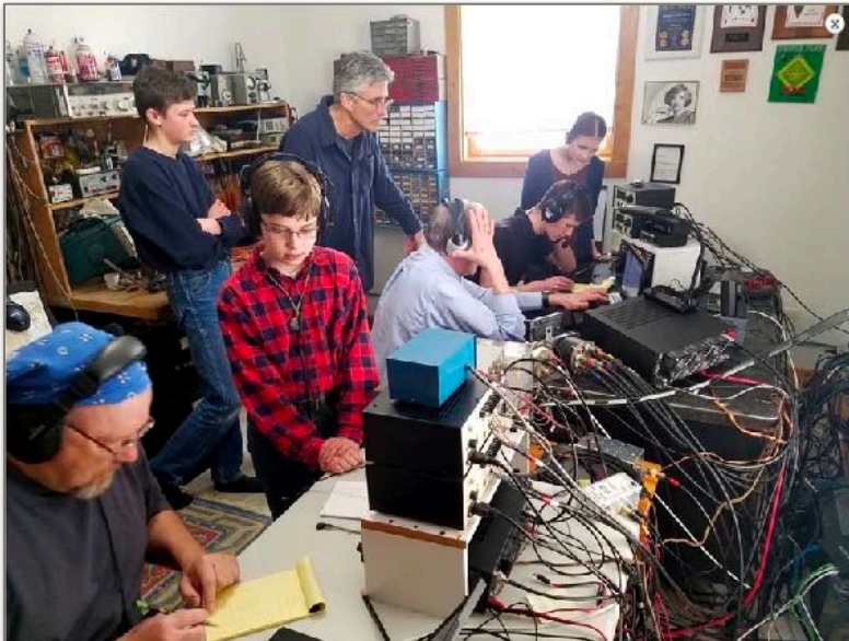
THE WINONA AMATEUR RADIO CLUB 2020 MINNESOTA QSO PARTY STATION.