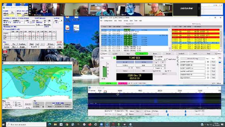
THE POPULAR FT8 DIGITAL MODE OPENS THE WORLD TO HAMS DURING POOR PROPAGATION, EVEN WITH LOW POWER. DICK LINDNER, WØRIF, SHOWED HOW AT THE CLUB'S DEC. 17 PROGRAM.

Individual stations may participate with the Minnesota members working everyone; Work stations once per band and mode. MN mobiles and rovers may be worked once per band and mode from each county, and MN mobiles and rovers may work stations once per band and mode.