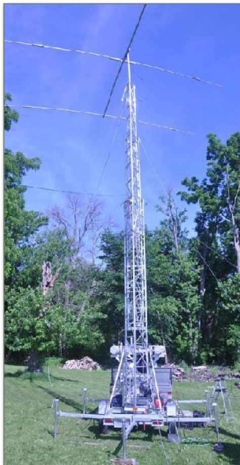
WINONA COUNTY EMERGENCY MANAGEMENT'S PORTABLE TOWER.