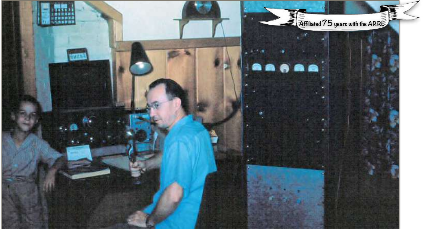
A WINONA AMATEUR RADIO CLUB MEMBER DOES SOME ELMERING. THE CLUB HAS BEEN AFFILIATED WITH THE ARRL 75 YEARS.