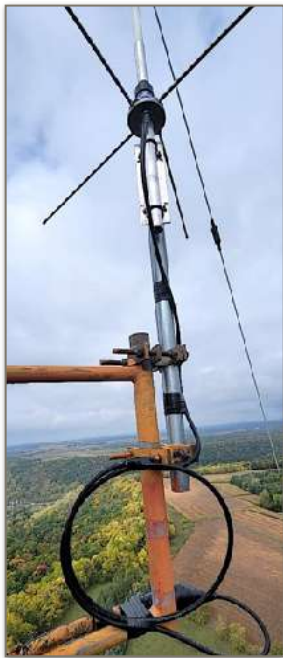
THE NEW WITOKA ANTENNA 'TAKING CALLS.'

radome was found days later in the field. No wonder we were having trouble getting into the repeater!