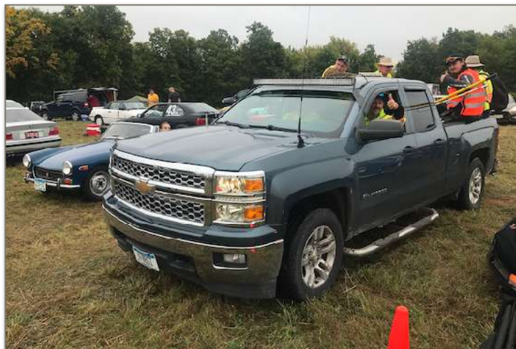
WINONA AMATEUR RADIO CLUB MEMBERS HITCHED A RIDE UP BLANK HILL ROAD WITH JUSTIN MCEL MURY, KFØBSI.

The skills we learn in net operation and in traffic handling transfer to the times we may be asked to support communications for a served agency. For example, use of the ITU phonetic alphabet to spell out names, homonyms, or unfamiliar terms works in formal as well as tactical traffic. Clear sending and accurate receiving are what we offer and what we practice.